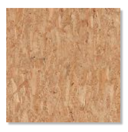
Basic Platform for own floor coverings

According to this, they are impact resistant, scratch and wear-resistant, lightfast, heat-resistant, hygienic and easy to clean.